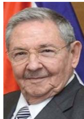
Raúl Castro