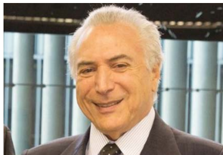
Temer

After a contentious 16-hour debate, Brazil's Congress early today passed Interim President Michel Temer's revised budget plan for the rest of this year, Folha de S. Paulo reported. The measure, seen as Temer's first victory in the legislature, allows the government's deficit to reach 170.5 billion reais ($47.8 billion). The previous government of President Dilma Rousseff had a budget deficit of 96.7 billion reais. Sen. Vanessa Grazziotin, a Communist Party of Brazil member who opposed the measure, called it a "blank check" for the interim government, and criticized the lack of clarity on how the money would be spent. The approved